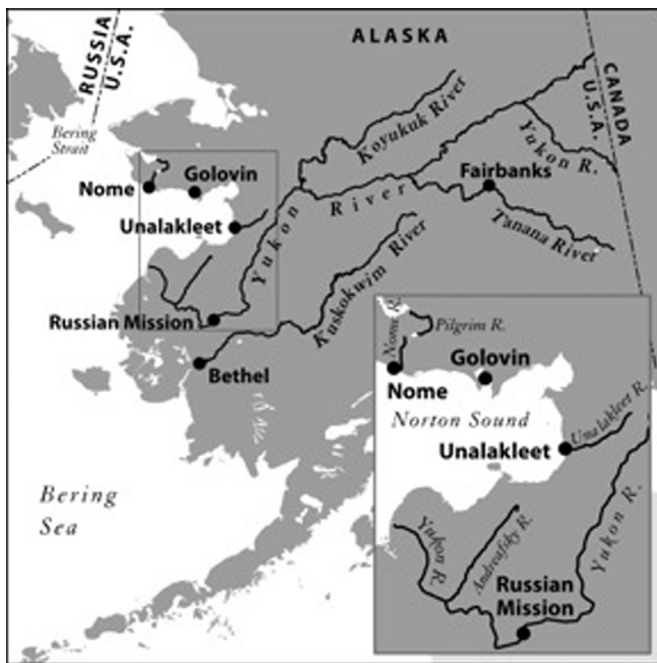
Fig. 1. Study area.

fisheries management accompanied by recommendations for this integration (Figs. 1 and 2).